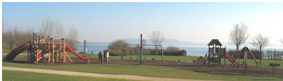
Nearby Play Ground