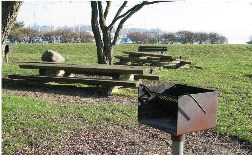
Grills, tables and benches